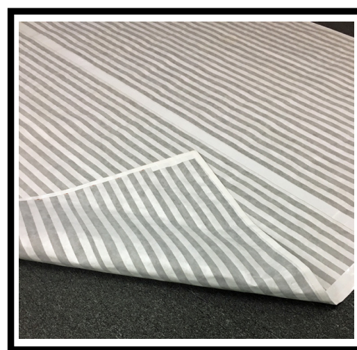
Brumark Sensor Floor

Contact us for more information and a quote!