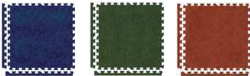
Shown with removable 1" straight edge